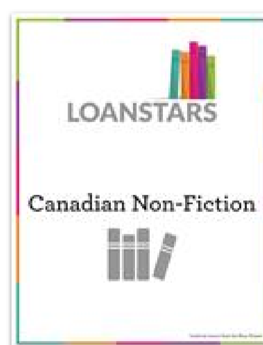
August 2017 Non-Fiction: Canadian

Log in to CataList and browse catalogues for upcoming books you can request, read, and vote for. (You'll see a VOTE button next to eligible titles.)