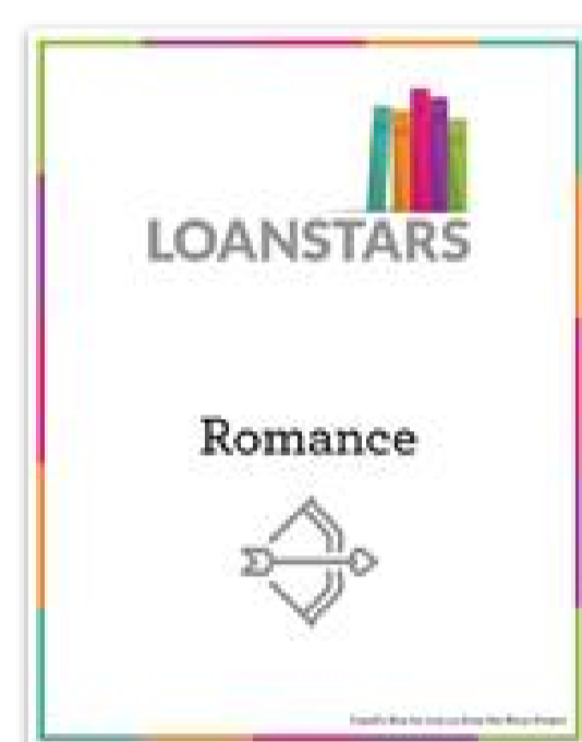
August 2017 Fiction: Romance

Find eligible titles to request and read.